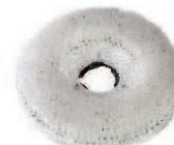
Ultra Hard Brush