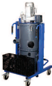
IVC 1550 IVC 3060