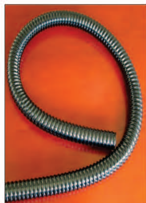
VACUUM HOSES (STEEL WIRE REINFORCED)