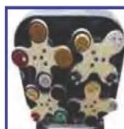
Available for many kinds of abrasive pads