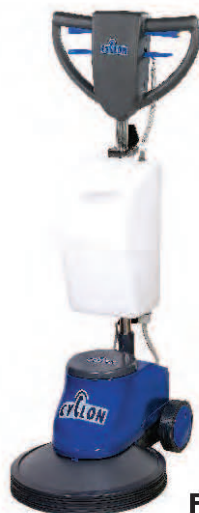
FM - 240