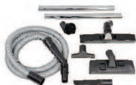
Vac 151 Tools