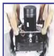
Convenient to carry