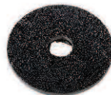
Pad Driver Disc