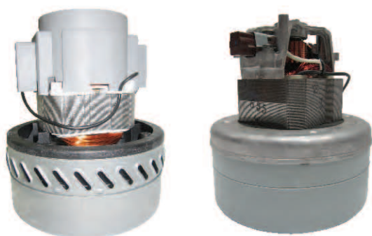
DRY / WET & DRY VACUUM MOTORS