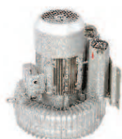
Powerful Turbine Blower