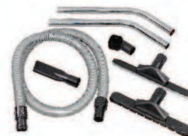
Vac 301/ 602/ 803 Tools