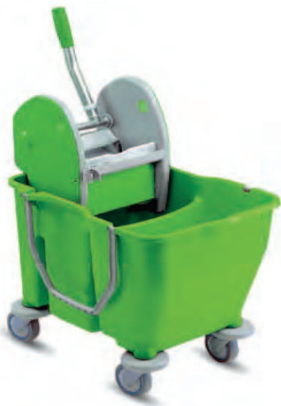
SINGLE BUCKET MOP WRINGER TROLLEY