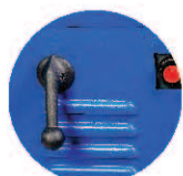
Phase reversal switch