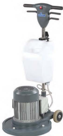
CYCLON MAX - 75