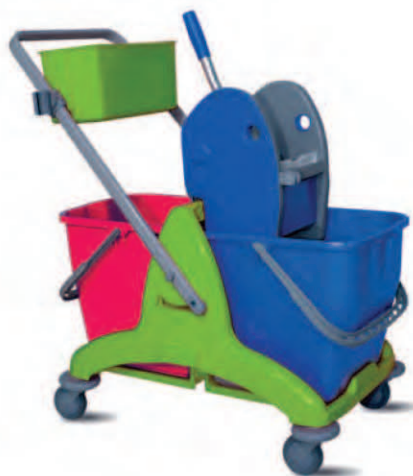
DOUBLE BUCKET MOP WRINGER TROLLEY