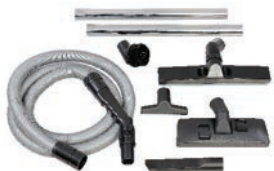
Vac 151 Tools