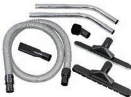
Vac 301/ 602/ 803 Tools