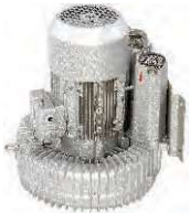
Powerful Turbine Blower