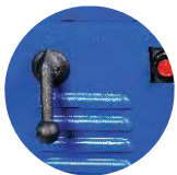
Phase reversal switch