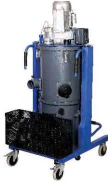
IVC 1550 IVC 3060