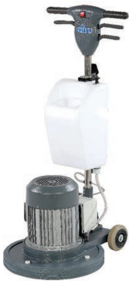
CYCLON MAX - 75