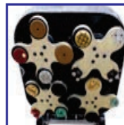
Available for many kinds of abrasive pads