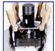
Convenient to carry